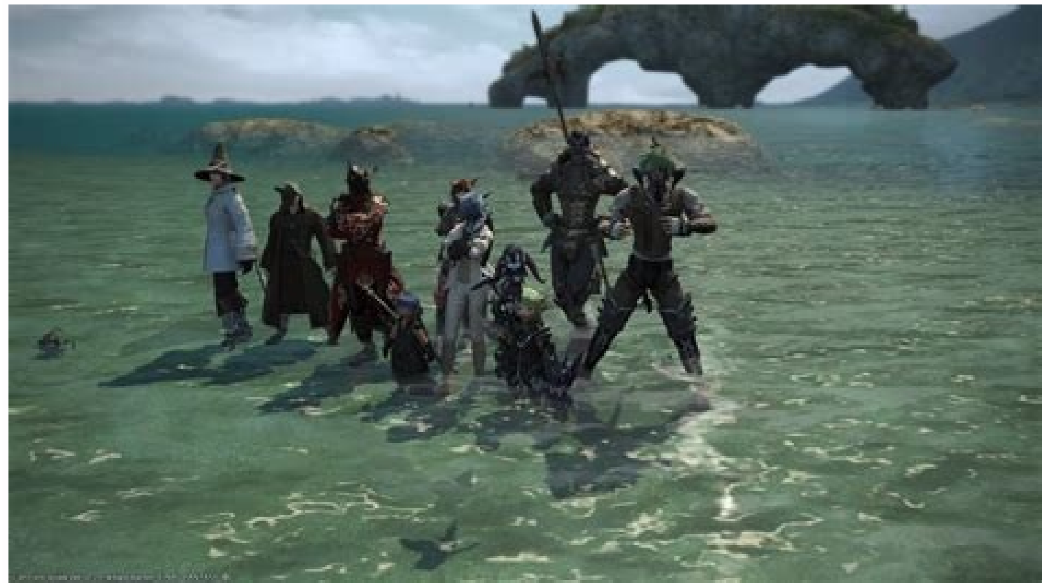
Ffxiv how to do fashion report. Ffxiv fashion report npc location. What is fashion report ffxiv. Ffxiv how does fashion report work. Ffxiv fashion report time.